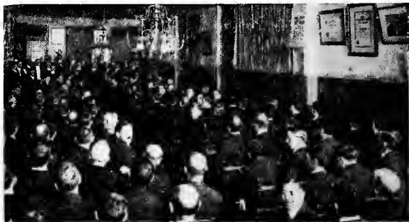
STUDENTS MEETING WITH A LABOR UNION

Through the "summer service" and industrial research programs, selected students are given actual experience as social workers and in industry, supplemented by lectures and discussions on the application of Christian principles to these phases of modern life.